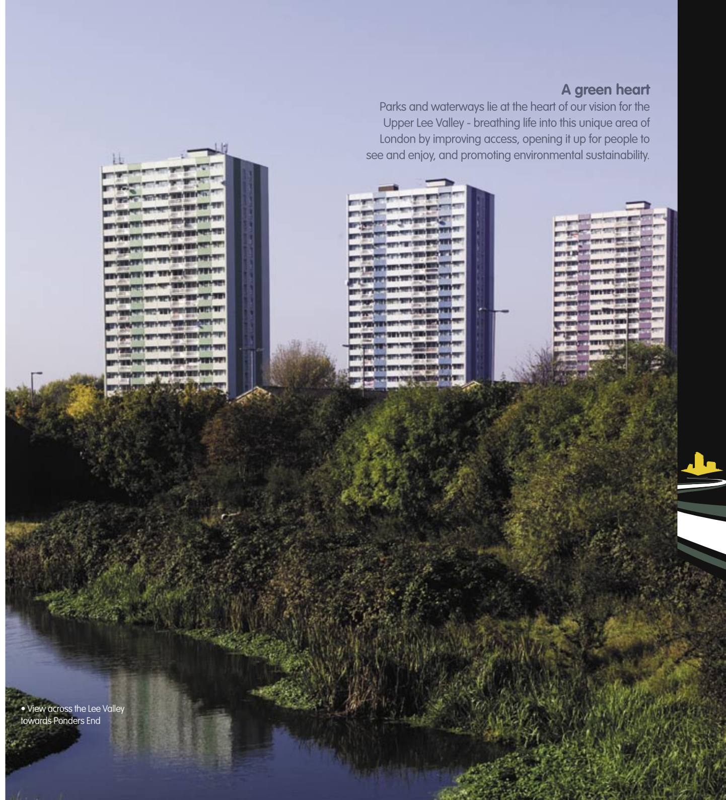
• View across the Lee Valley towards Ponders End

Parks and waterways lie at the heart of our vision for the Upper Lee Valley - breathing life into this unique area of London by improving access, opening it up for people to see and enjoy, and promoting environmental sustainability.