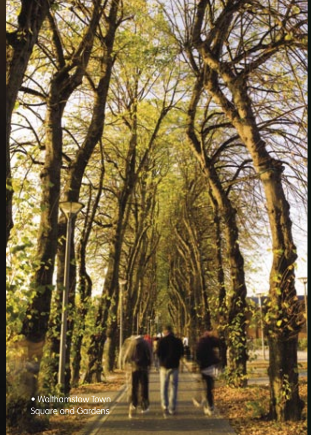
• Walthamstow Town Square and Gardens