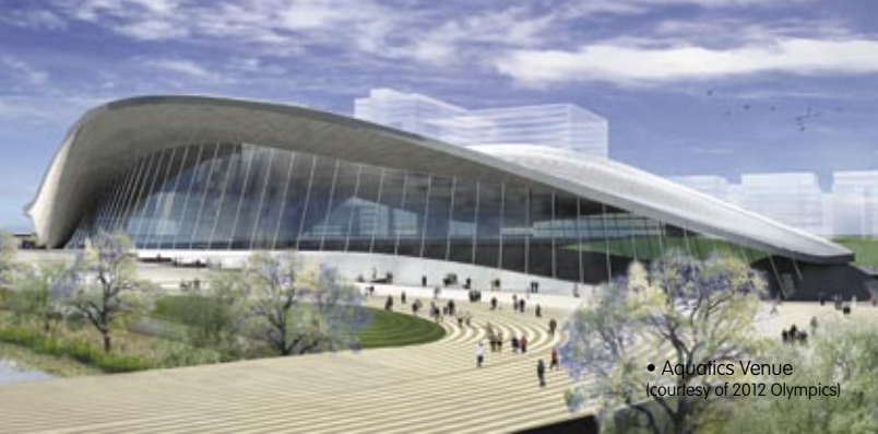
• Aquatics Venue