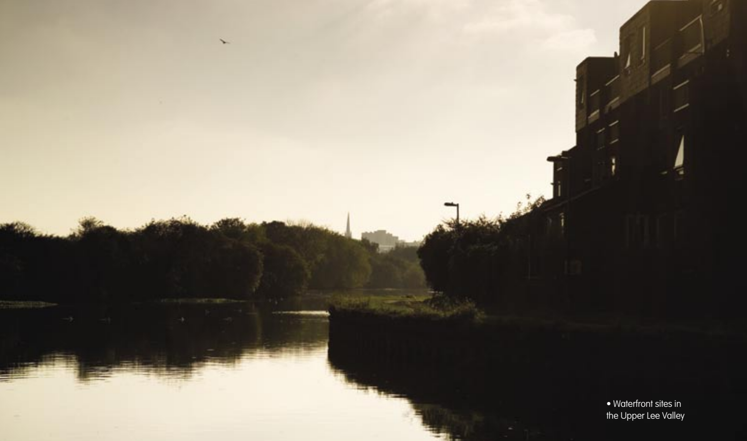
• Waterfront sites in the Upper Lee Valley